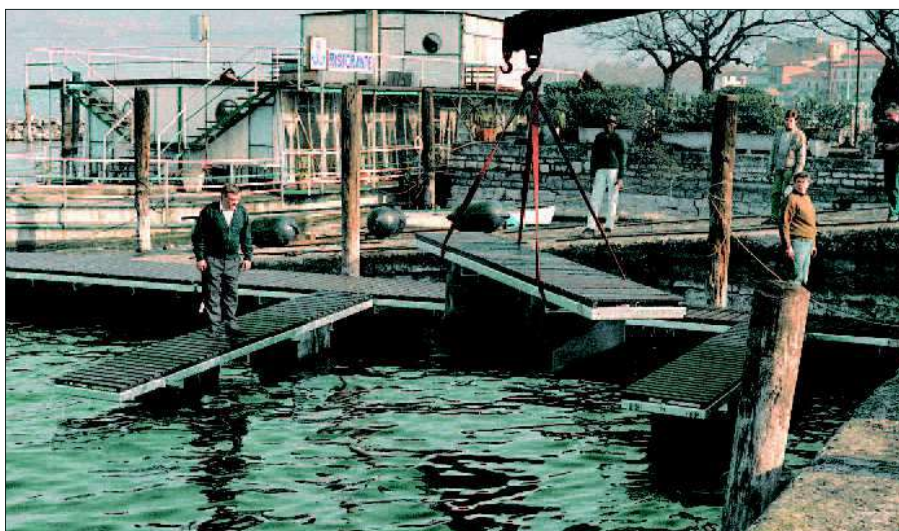
FLOATING QUAY ASSEMBLY