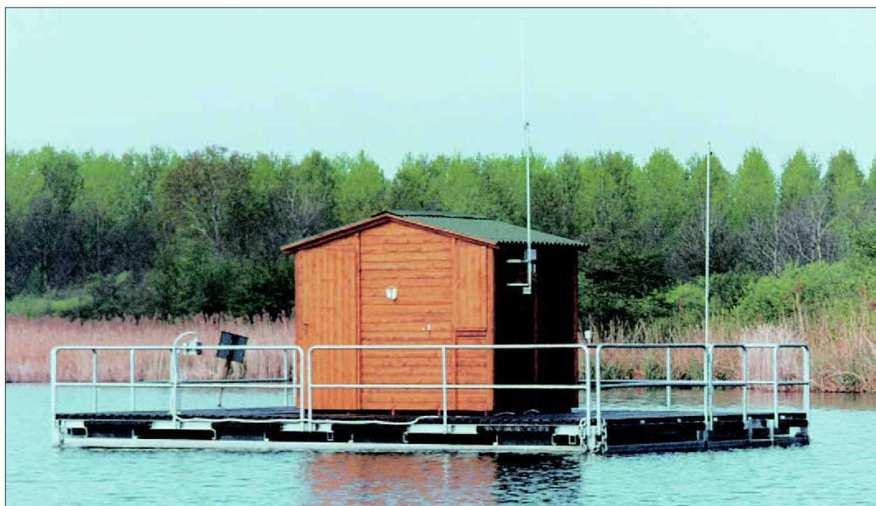
FLOATING HOUSE ARCHEOLOGICAL MONITORING

The modules can be fastened together by means of hot-dipped galvanized steel hinges, or by blocks of anti-abrasion and no-noise elastomer polyurethane.