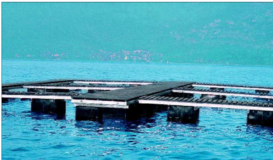
FLOATING BOATS QUAY